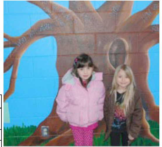
Needham Int'l Baccalaureate Programme of Inquiry Tree